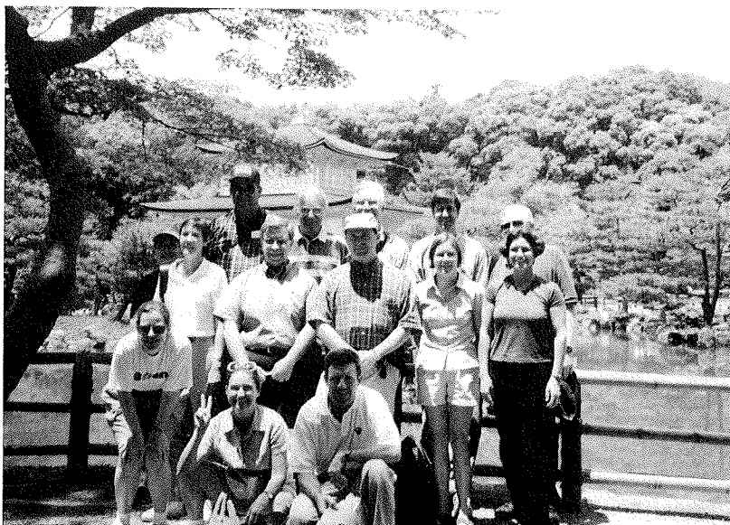
2000 Freeman Foundation College in Asia Summer Institute participants at Kinkakuji (Golden Pavilion) in Kyoto