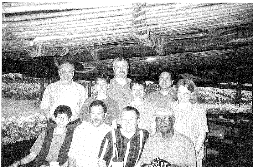
South Asia Ford Foundation Participants in Goa, India, summer 1999

Now that the twenty-first century has begun, these faculty will contribute to preparing students to appreciate the significant role Asia and Asians will play in this new millennium. ASIANetwork members not fortunate to have participated in this now-concluded initiative are urged to consider participating in the other Asian studies-enhancing opportunities our association provides. They will find excellent opportunities for self-enrichment and intellectual service to their schools and communities.