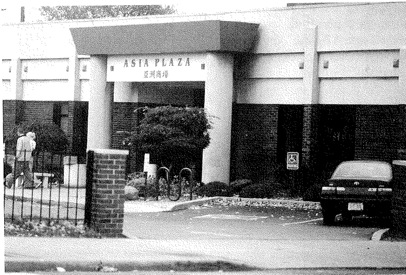
Pre-Conference Tour Sights/Sites Asia Plaza Mini-Mall, Cleveland, Ohio For more details on the Pre-Conference Tour, see page 6.