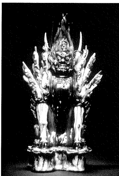
Human Head Tomb Guardian Chinese, late 7th or early 8th century Tang Dynasty, Ceramic ( sancai ware) The Cleveland Museum of Art

ASIANetwork Spring Board of Directors Meeting - Director "B"