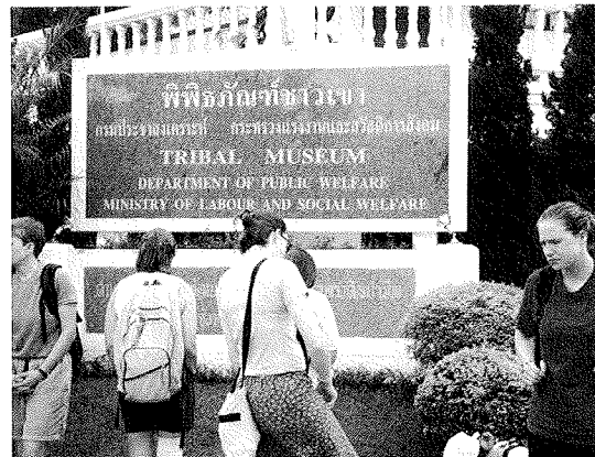
ASIANetwork Freeman Student Faculty Fellows Program Summer 2001 Carthage College students at the Tribal Museum in Bangkok, Thailand