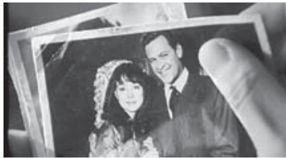
Xiaojun looks at the pictures from his aunt’s treasure trunk. Comrades, Almost a Love Story (1996)

comments on how his pregnant wife eats just like Wang Li does, because she, too, “worried about the baby’s nutrition.” Then, just before he leaves, he says curtly to Wang Li “When he grows up, don’t hide the truth from him. Tell him exactly who his father was. There is nothing to be ashamed of.” Whether it is the mention of the baby or the detective’s leaving, Wang Li stops eating and sits still for a few seconds. Then she resumes eating, mechanically doing the Peking duck routine—placing pieces of duck slices into a pancake, dipping green onion pieces into the sauce, wrapping the pancake into a roll, and then biting and stuffing the