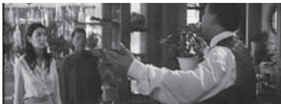
Charlie Soong throws his arms and says to Qingling: "We've become laughing stocks." The Soong Sisters (1996)

According to Charlie, the personal offense makes him