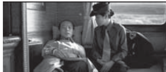
Uncle Li advises Leaf: "Greatness is ruthless." A World without Thieves (2004)

Because women are concerned more with "here and now," they also tend to make decisions that address the current situation. A scene from A World without Thieves shows how Wang Li and Wang Bo (the Chinese Bonnie and Clyde) hold