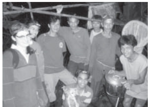
2005 Lawrence University ASIANetwork Freeman Student Fellows interact with Filipino hosts during field research on bats.