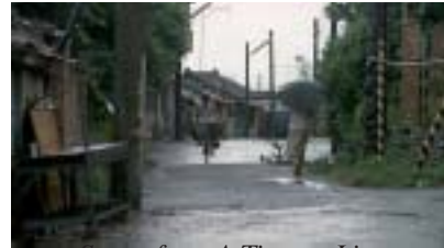
Scene from A Time to Live, A Time to Die

By the end of semester, students' understanding of the history of Chinese film changed. I was pleased with their final papers because I knew they finally embraced contemporary Chinese film, the most difficult category to understand in the history of Chinese film. I was particularly amazed with the students' ability to integrate class discussions and the assigned readings into their papers, providing some thought-provoking insights about the films on which they chose to write. Course evaluations indicated that students not only learned a great deal but also thoroughly enjoyed the class.