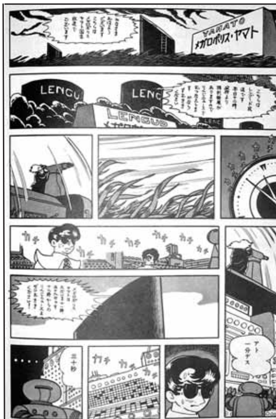
Figure 1. From Phoenix: Future

The three panels that comprise roughly the middle section represent a typical example of aspect to aspect transition, in that each image moves through space but not time; we move (right to left) from the ticking clock, the wind blowing