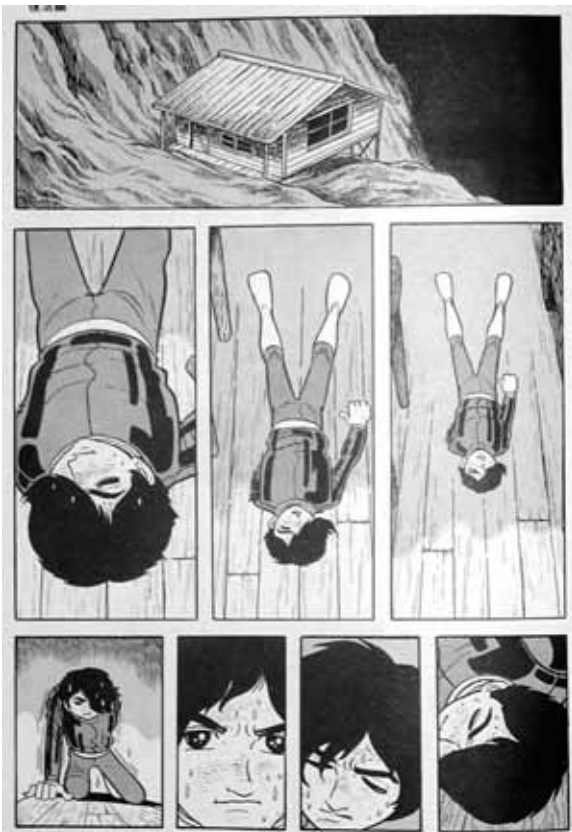
Figure 2. From Phoenix: Resurrection

through the grass, and then to the character of Dr. Saruta, who gazes on from within a glass dome. These panels—comparable to the impressionistic “pillow shots” of celebrated director Yasujiro Ozu—do not move the narrative forward in any way, but set a contemplative, forbidding mood, and serve to remind the viewer of nature and creation in the face of ultimate destruction.